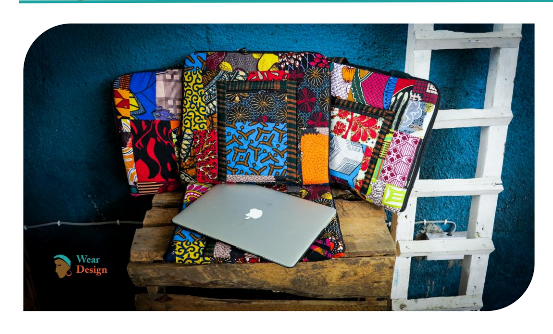
Laptop case : 13 x 16 in / 34 x 40 cm