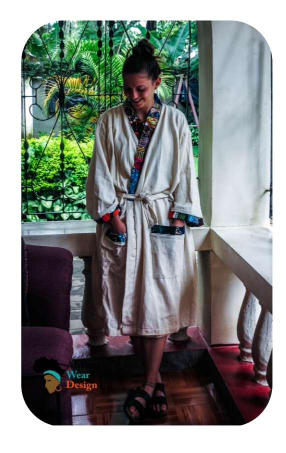
Beige weaved cotton fabric: Tailor made