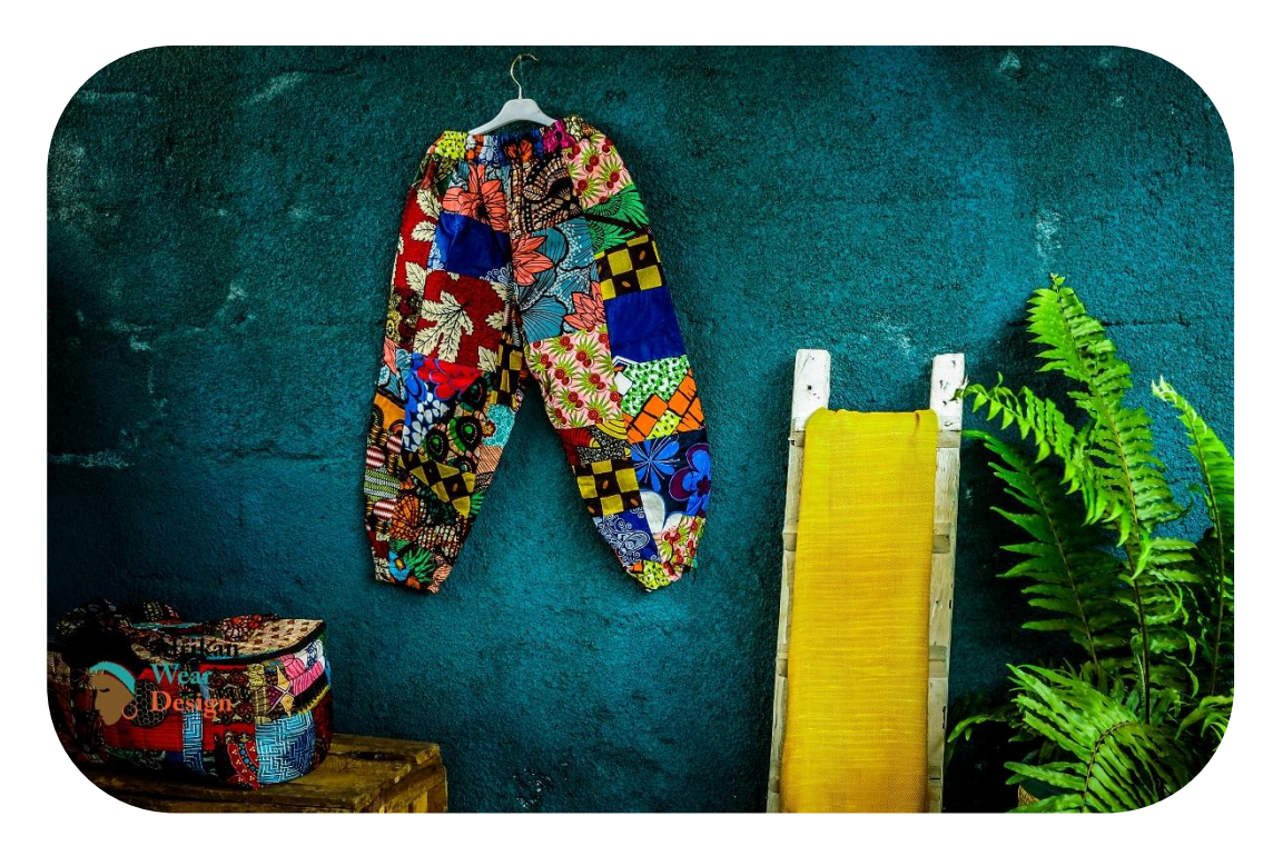
Pants: Tailor made