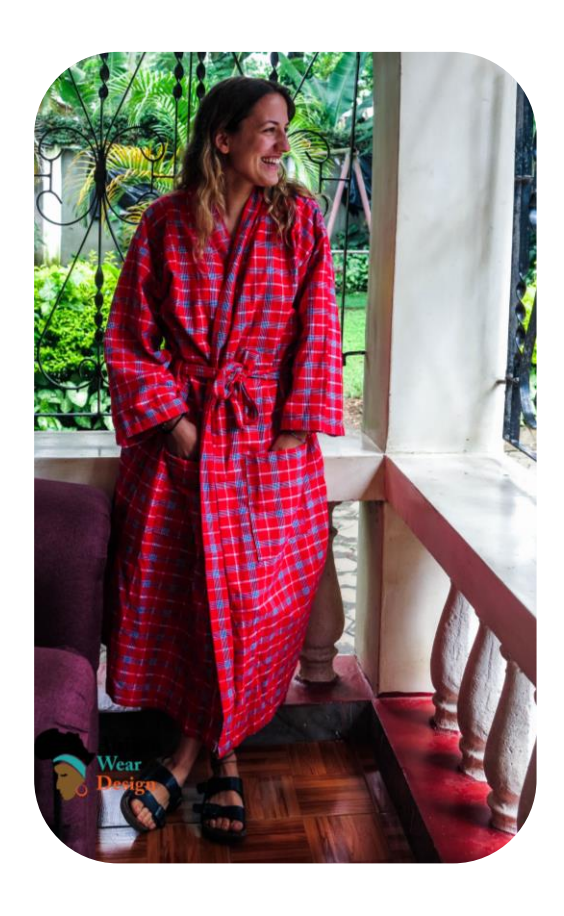
Masai tribe blanket style: Tailor made