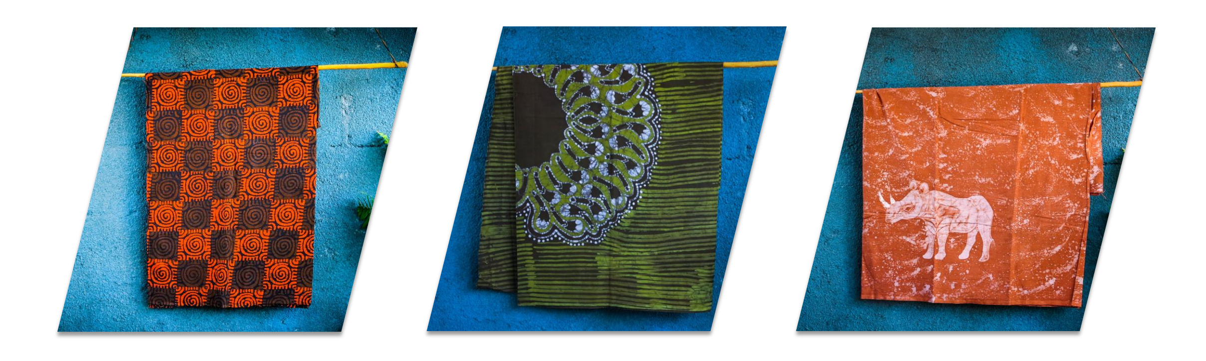
Batik: Tailor cut