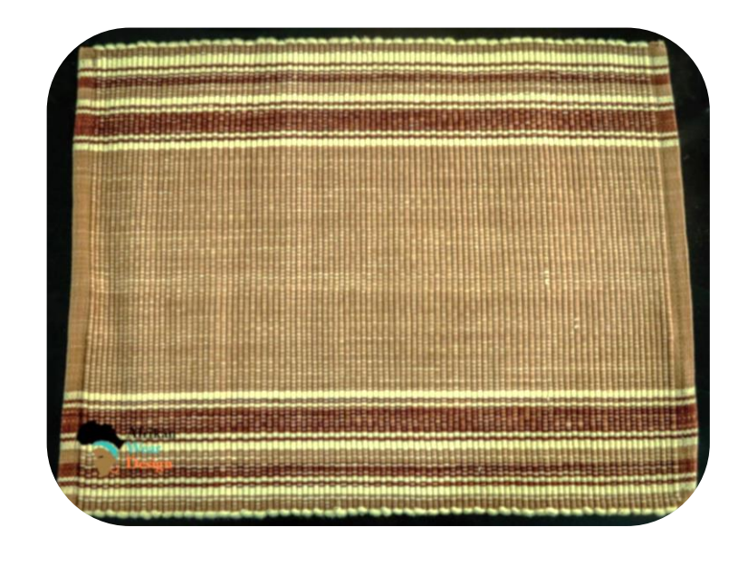
Table mat: 17 x 12 in / 42 x 31cm