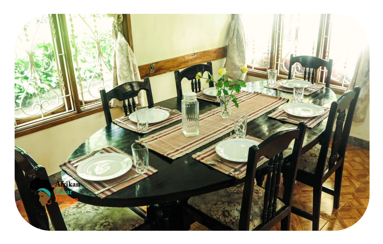
Table runner: 13 x 50 in / 32 x 126 cm