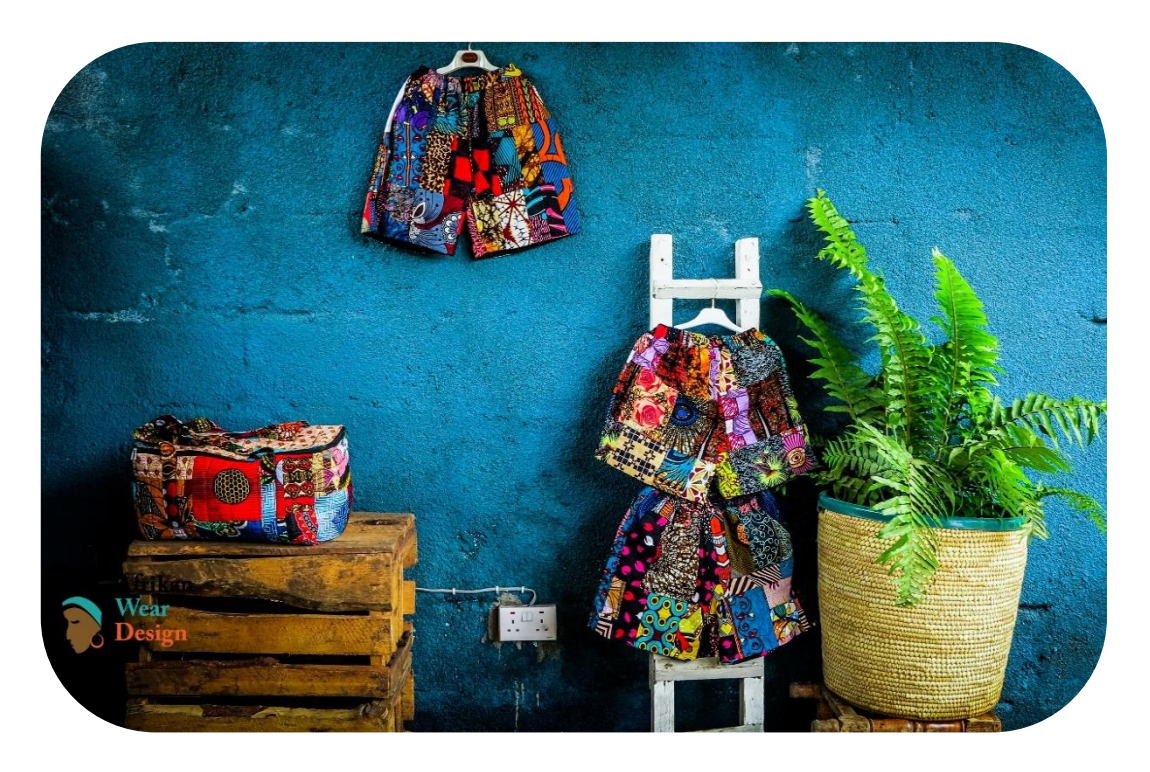
Shorts: Tailor made